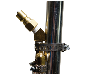
Solution hose quick connect

Designed for quick and easy flood extraction in preparation to the final drying process. The Water Claw's speed, performance and profitability in doing most flood jobs WITHOUT removing carpet and pad has been proven in thousands of flood restorations worldwide. In addition, the Water Claw Flood Extractor can be used to quickly evacuate black water floods allowing you to more easily remove and carry out carpet and pad.