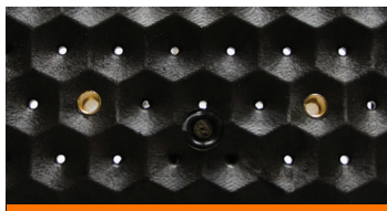
Flushing ports - bottom